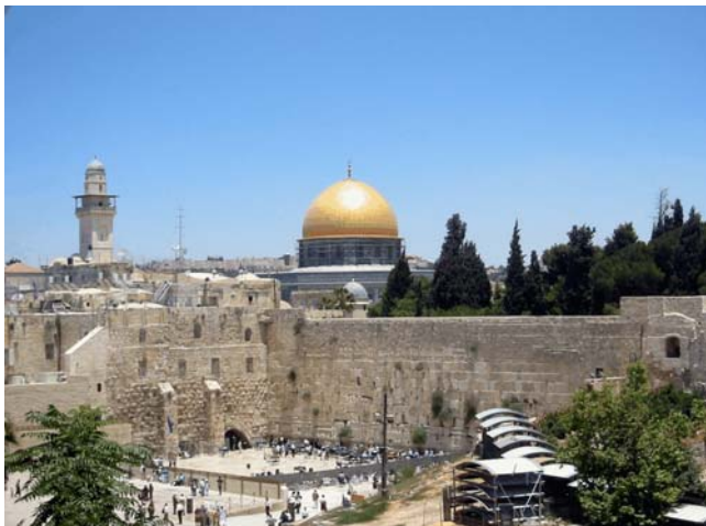
The Old City of Jerusalem

After arrival at Ben Gurion Airport in Tel Aviv, we will be met by our local guide who will arrange the schedules of our visits and make the scripture come alive as we follow in the footsteps of Jesus. Drive to our hotel in Jerusalem.